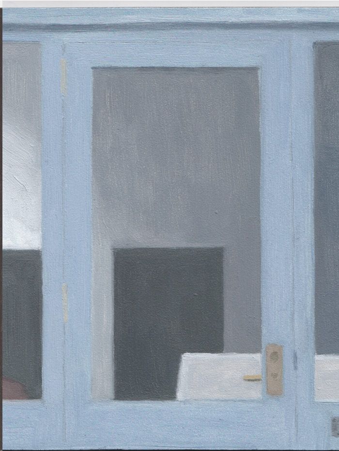
Spring Street Doorway , 2015, Eleanor Ray